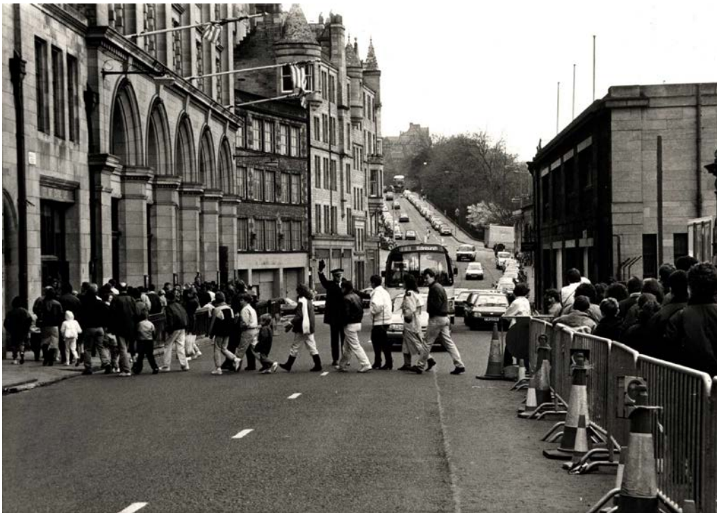
Crowds line the street to see The Gold of the Pharaohs exhibition in 1988

To mark the anniversary, the City Art Centre is mounting a special 'highlights' exhibition from the City's collection of Scottish art, set to open in mid-September. Widely recognized as being one of the finest in the country, the collection numbers over 5,000 works of art ranging from some of the earliest views of Edinburgh to works by many of Scotland's leading contemporary artists. In addition, the gallery has created a 'curation' on the Art UK website, where former members of staff, critics, and gallery directors have all chosen their favourite painting or sculpture from the collection. You can view it here: http://ow.ly/UwPO50B1zPf