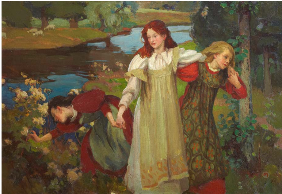
Credit: Charles H. Mackie, There were Three Maidens pu'd a Flower (By the Bonnie Banks o' Fordie) , c.1897. City Art Centre, Museums and Galleries Edinburgh

Further information on these exhibitions will be provided in the Bulletin for the next meeting of the Culture and Communities Committee.