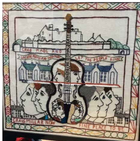
Craigmillar Tapestry – violin panel (designed by Andrew Crummy) at Castlevue Primary celebration event, 5 December 2019

Funding for Phase 2 of the project has been applied for.