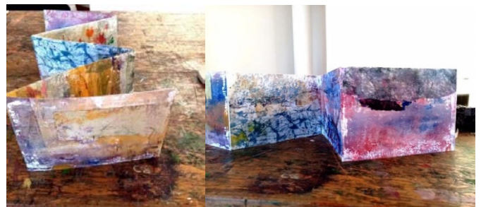
Landscape Abstractions: A Window of Memory